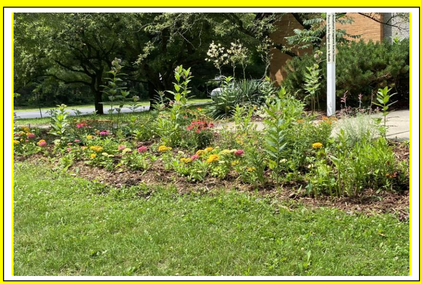
Bridges & Butterflies