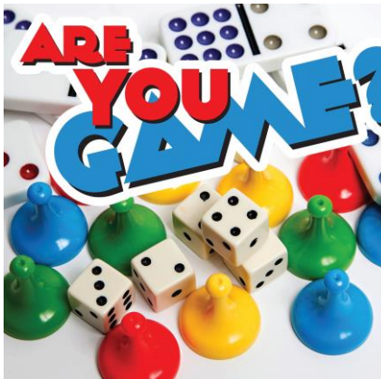
Table Games Afternoon – Sunday, October 9, 3 – 6 pm.

We will be focusing on Care Kits in September. Please drop off your donations at the LWR table in the Narthex. School Kit items are still being accepted.