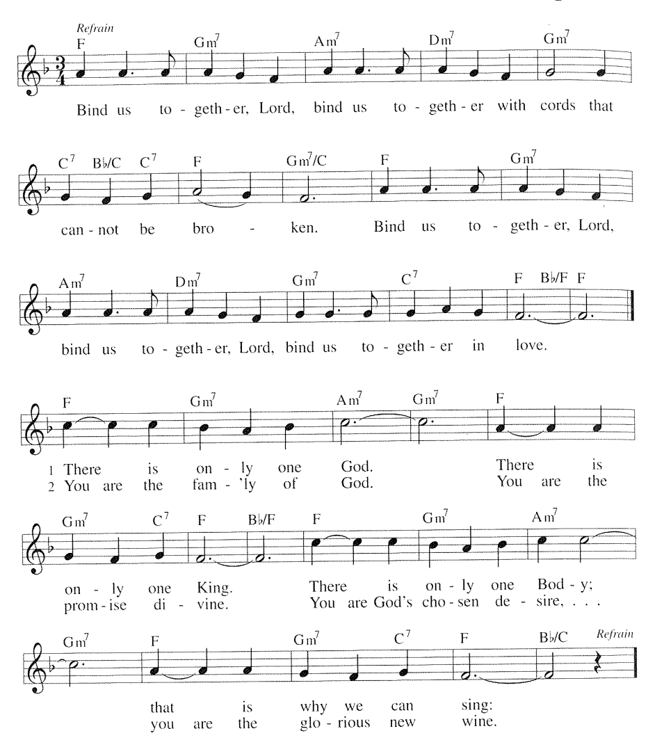
Text & Music: Bon Gillman Printed under CCLI license #720217